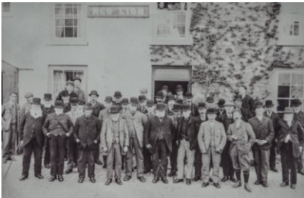
The Court Leet meeting about 1900 outside the Red Lion.

The Church of St Cynidr and St Mary will also be open from 10.00 am and the old registers will be available for inspection. Meet at the Village Car park (Opposite Llangynidr Village hall, Cwm Crownon Road, NP8 1LS)