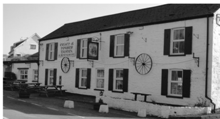
The Coach and Horses as it is today.

The Coach and Horses started life as a stabling stop for coaches using the ancient Brecknock Way. Probably dating from the 1600's, it has been an inn since the 18th century.