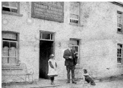
The Coach and Horses 1905 with the owner and his granddaughter, who later owned it.

The walk is approximately 2.3 miles and may have three stiles to negotiate although there is a longer walking route that avoids them. Other points of interest will be pointed out on the way. We will end up at The Red Lion next to the car park which will be open!