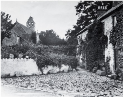
The Red Lion Inn about 1900