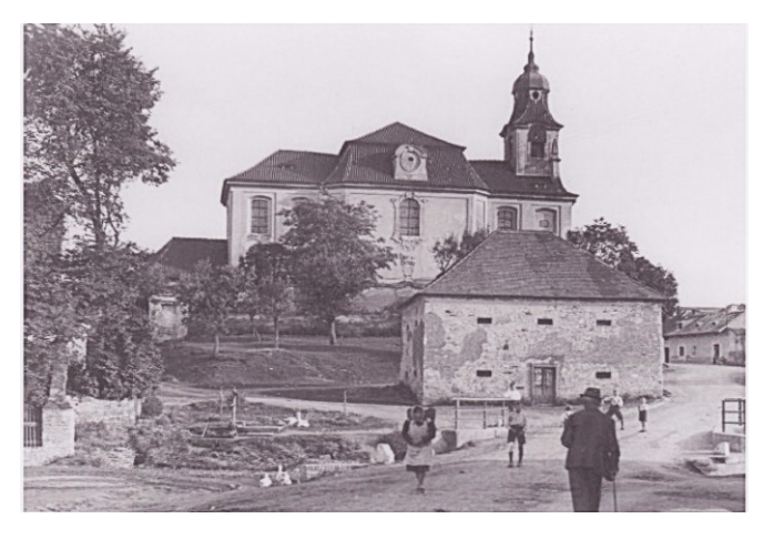
St Martin's Church, Lidice in 1941. The location of the last remaining Pear Tree